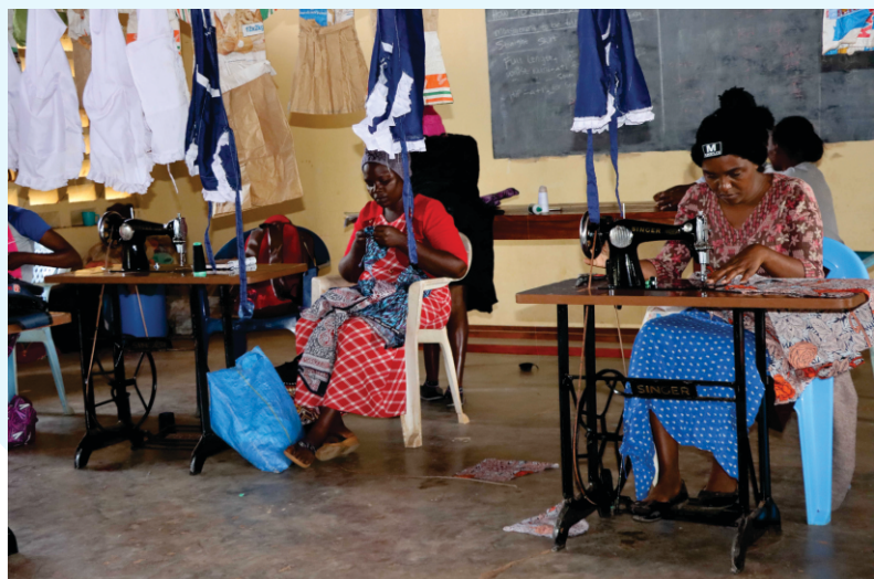
Beneficiaries during a tailoring session