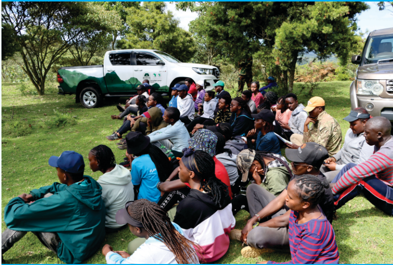
Participants listening to speeches at the Aberdare forest

"With the conservation effort, you are being sent out as ambassadors to educate others to do anything that can conserve the environment an impact the society positively," DEKUT Deputy Vice Chancellor