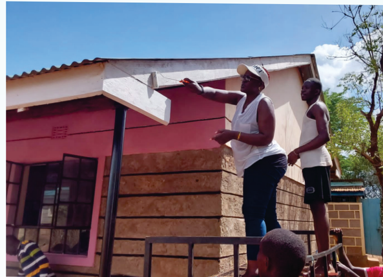
PA-K participants from Taveta painting classrooms and donating food and other essentials to Taveta Special School for the Visual and Hearing impaired during their Gold Residential project.