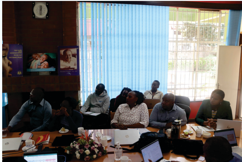
PA-K and SOS staff during a joint meeting at the SOS Village Nairobi. PA-K and SOS have identified areas of collaboration to strengthen youth development.