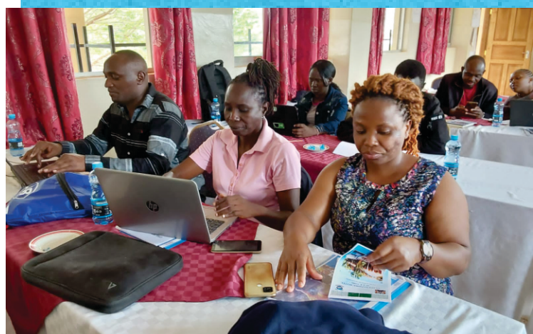
Award leaders from coast region