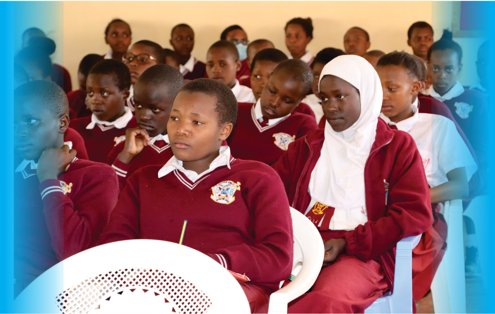
Award participants listening to speeches during the visit

Kapkoiga Girls High School is a Public, Extra County level, Girls Boarding Secondary School located in Cheptiret town, Uasin Gishu county with a population of 564 students. The school has 79 President's Award participants in the programme who are almost completing Bronze and Silver Award, more are still registering. They are supervised by three Award leaders.