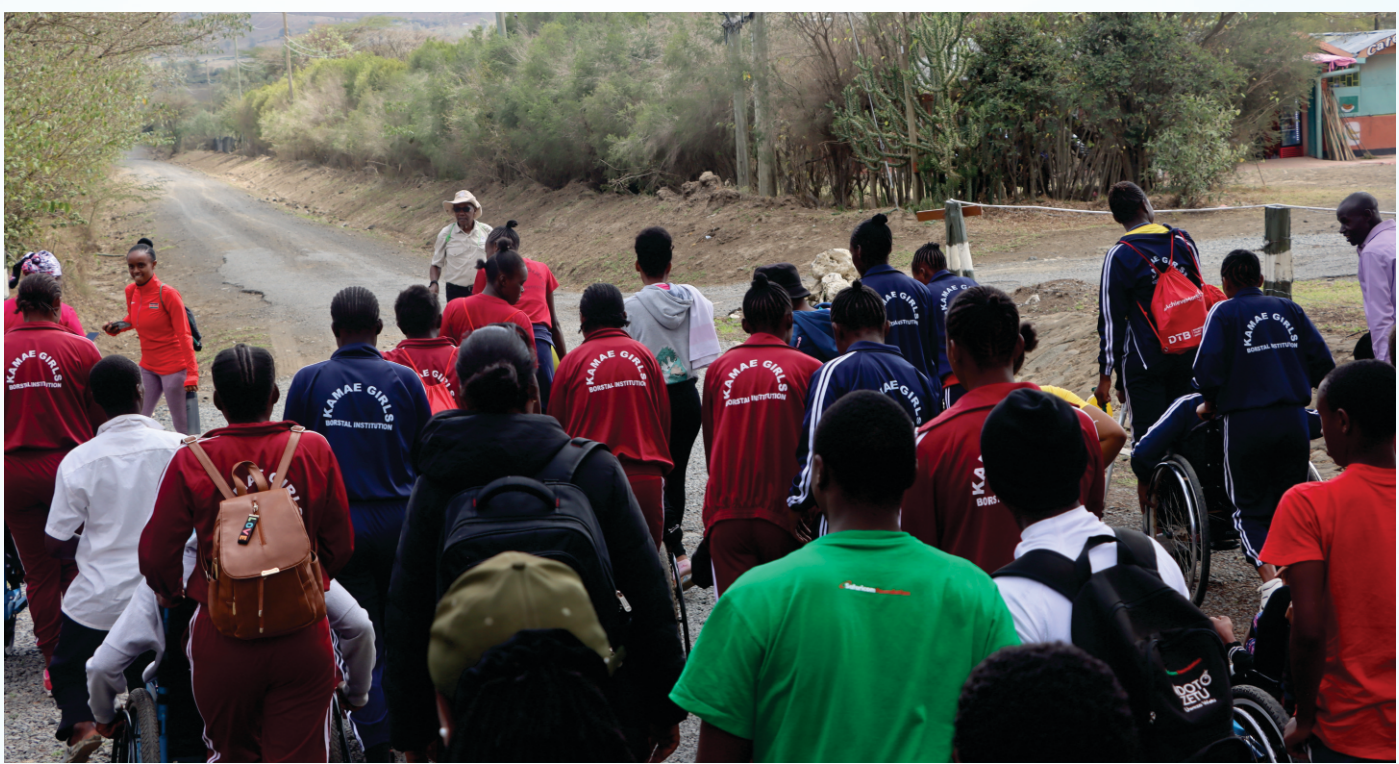
Participants from different schools in central region prepare to begin their adventurous journey in Mt. Longonot