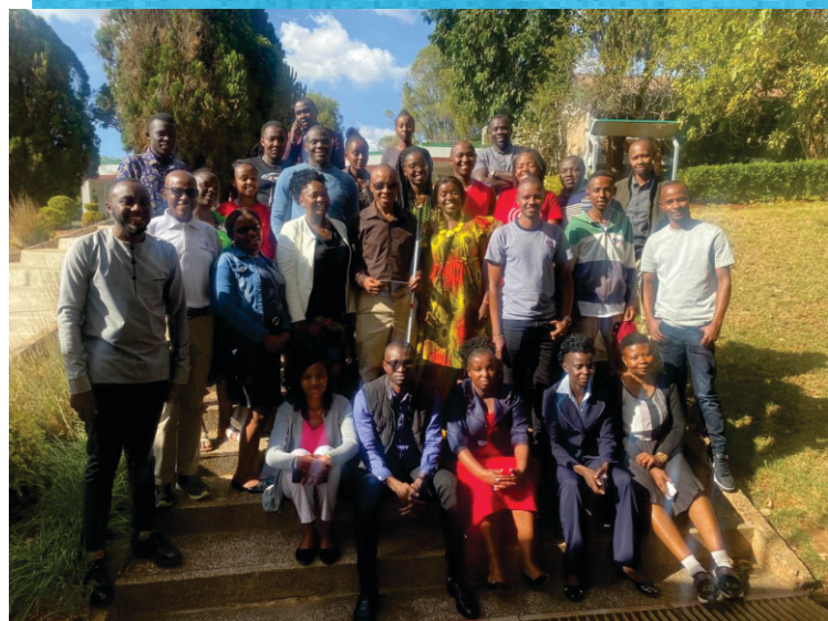
Award leaders from Central region

She noted that in most Award centres, the number of students vis a vis the number of Award participants is very low. "Where we are delivering the Award programme, at individual institution level, let us get as many young people as possible joining the Award programme," she urged.