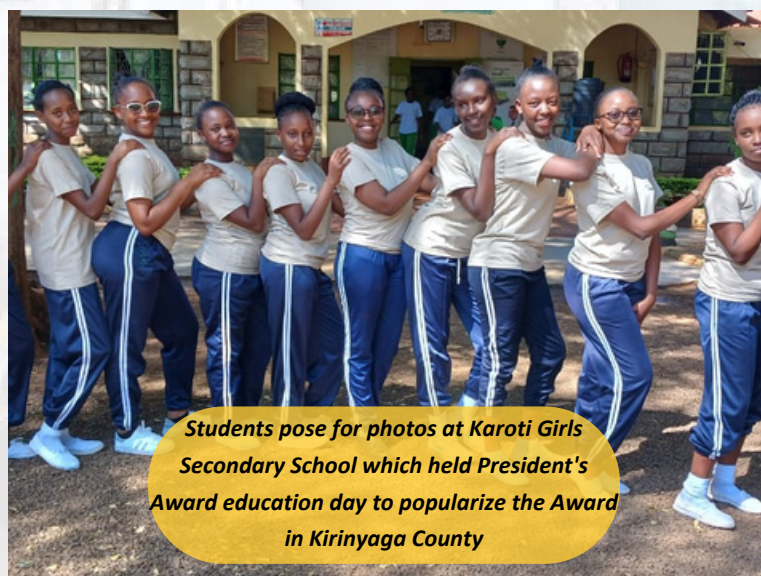
Students pose for photos at Karoti Girls Secondary School which held President's Award education day to popularize the Award in Kirinyaga County