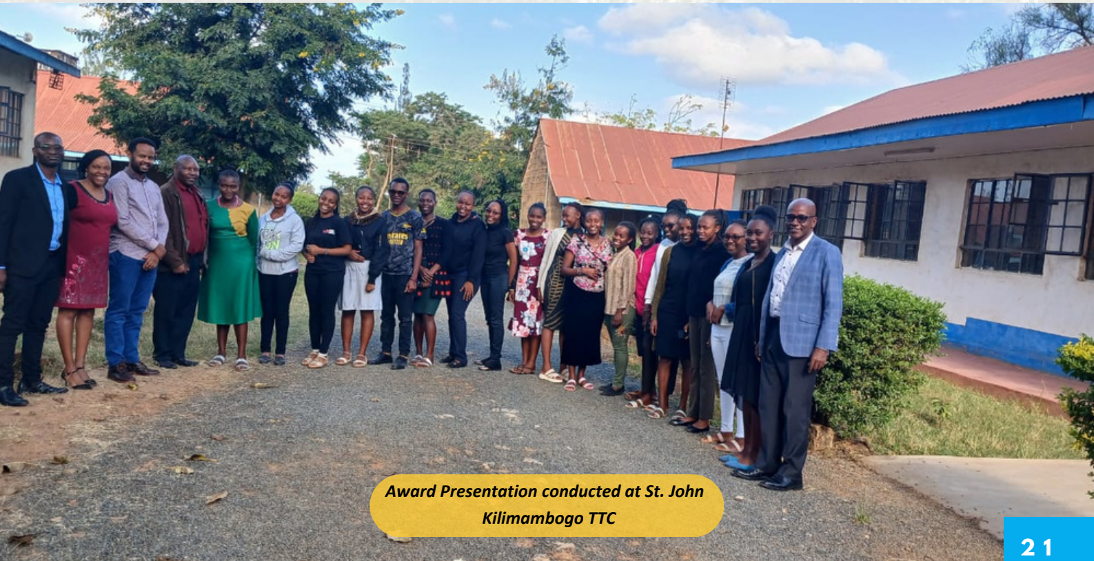
Award Presentation conducted at St. John Kilimambogo TTC