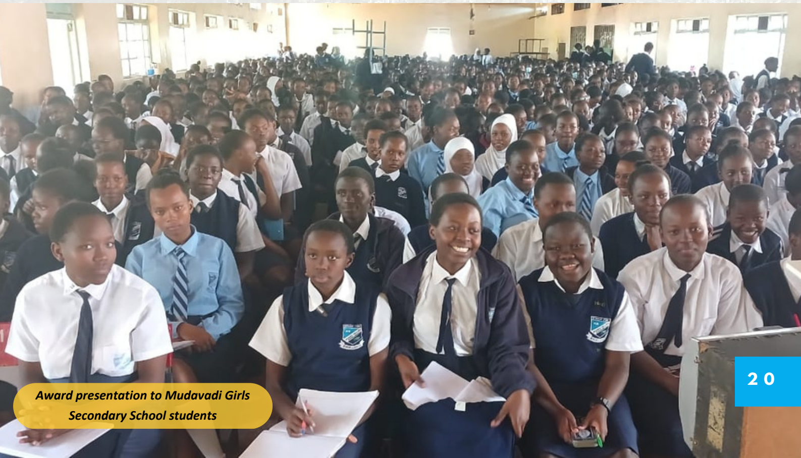
Award presentation to Mudavadi Girls Secondary School students