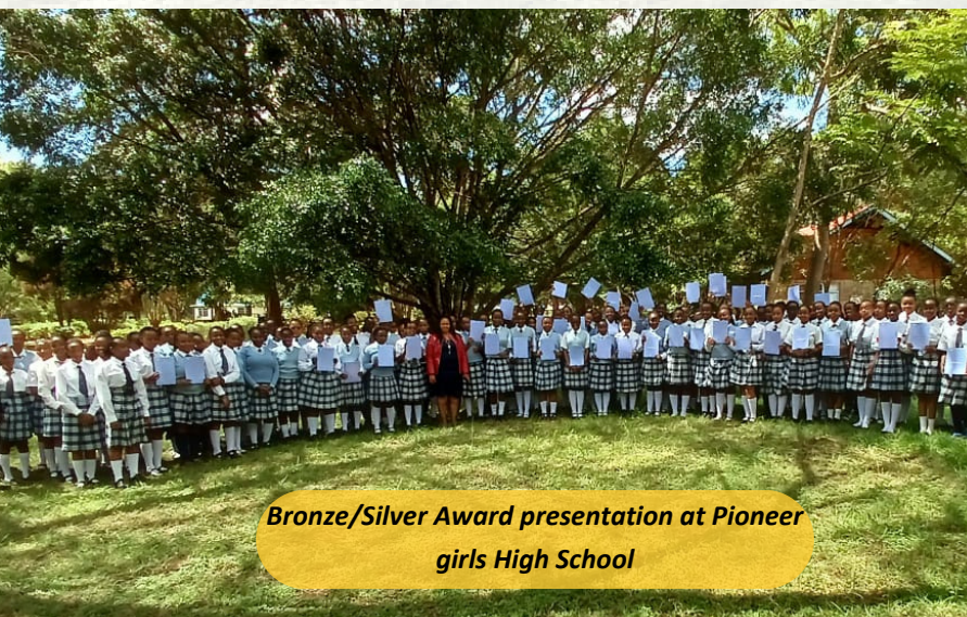
Bronze/Silver Award presentation at Pioneer girls High School