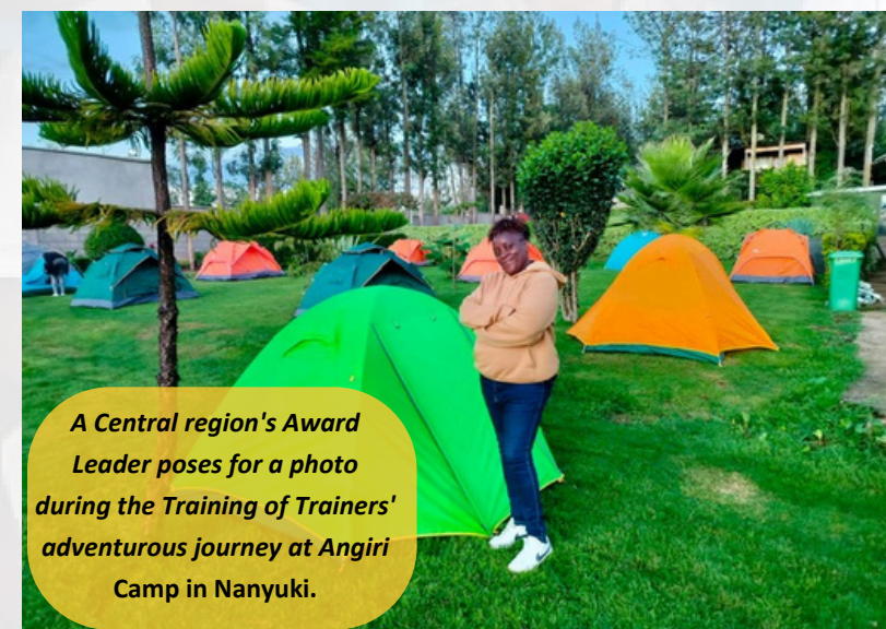
A Central region's Award Leader poses for a photo during the Training of Trainers' adventurous journey at Angiri Camp in Nanyuki.