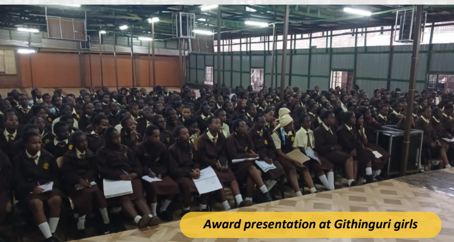
Award presentation at Githinguri girls