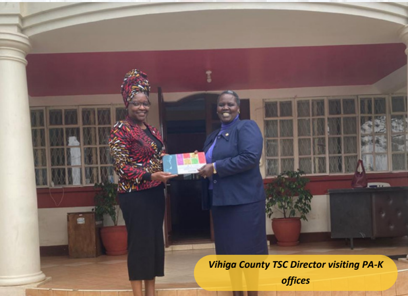
Vihiga County TSC Director visiting PA-K offices